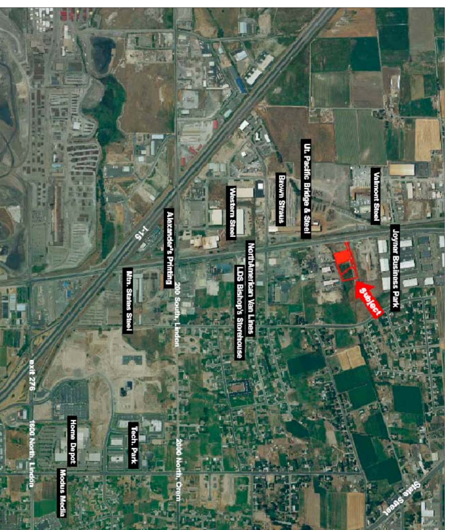
VICINITY ARIAL VIEW

LOT #2 MOUNTAIN VIEW INDUSTRIAL PARK 240 N GENEVA RD, LINCON, UTAH.